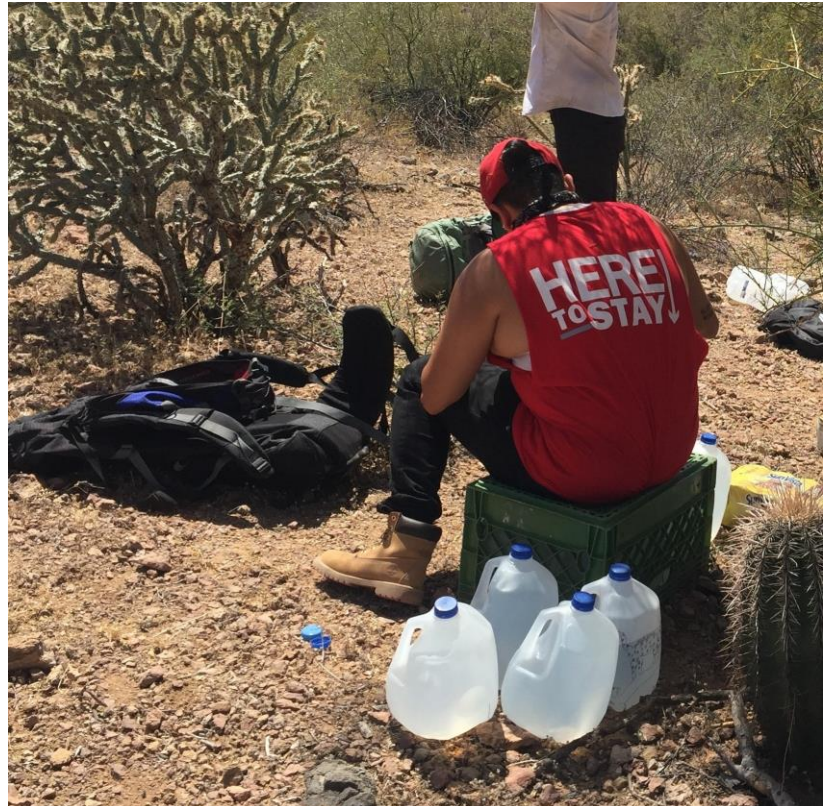
A volunteer sports a DACA-themed shirt while on a water drop somewhere in the Ajo migration corridor in April.

After the June raid, you stood with us. You nearly doubled the $10,000 fundraising goal we had set that month. Volunteer applications increased. Three thousand people signed our petition calling for the Border